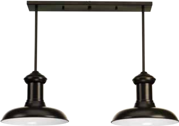
P8404-20 Shown with P5024-2030K9 mini-pendants