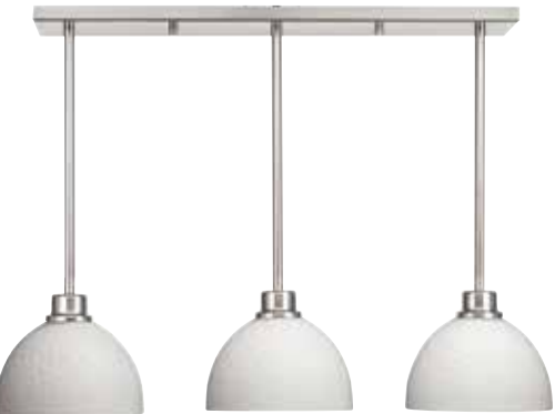
P8404-09 Shown with P5032-09 mini-pendants