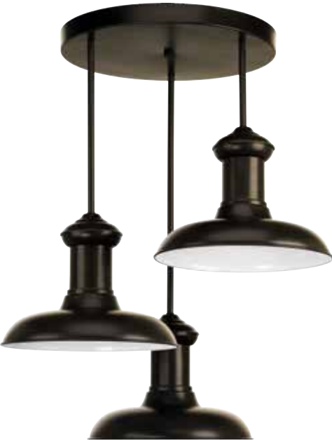
P8403-20 Shown with P5024-2030K9 mini-pendants