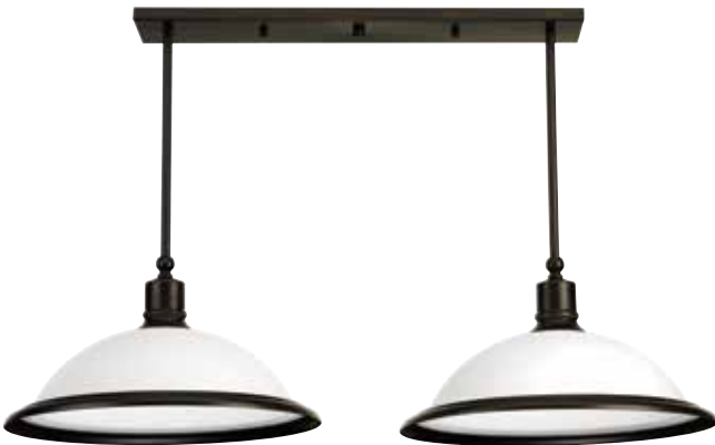
P8404-20 Shown with P5079-20 mini-pendants