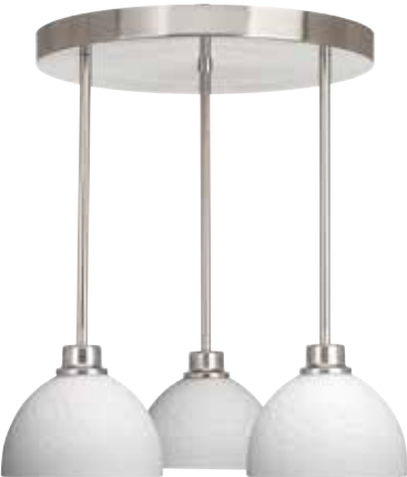
P8403-09 Shown with P5032-09 mini-pendants