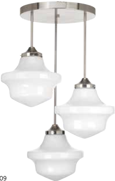
P8403-09 Shown with P51965-09 mini-pendants