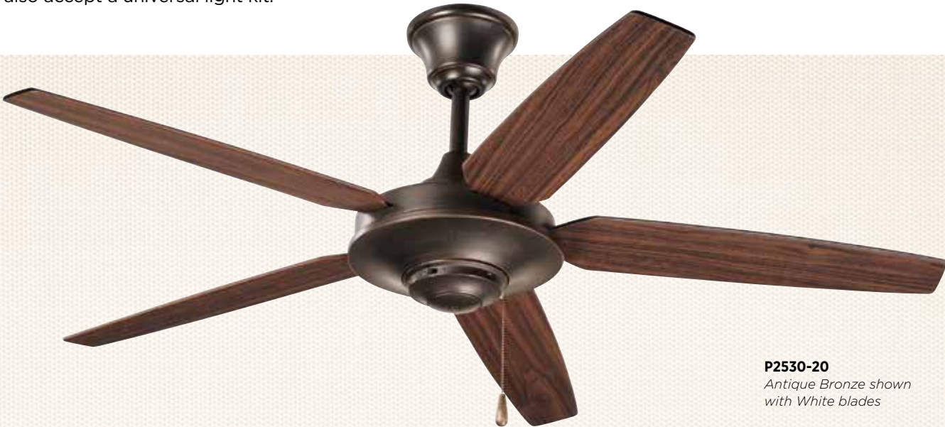
P2530-20 Antique Bronze shown with White blades