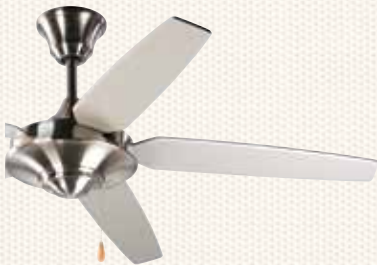
P2530-09 Brushed Nickel shown with Silver blades