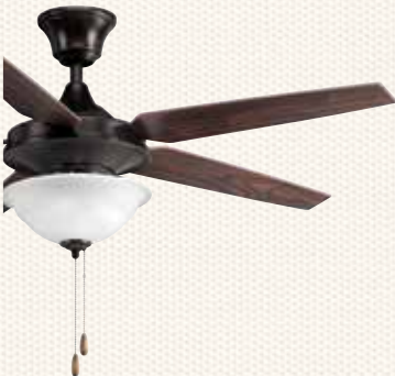
P2530-20 Shown with P2645-01WB light kit* Antique Bronze shown with Classic Walnut blades