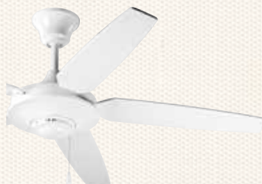
P2530-30W White shown with White blades