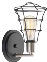
P300028-143 mounted up