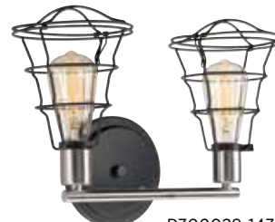
P300029-143 mounted up