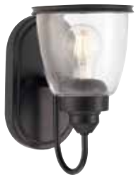
P300178-020 mounted up

P300179-009 Brushed Nickel P300179-020 Antique Bronze 15-1/2" W., 9-1/2" ht. Extends 7-3/4". H/CTR 5". Two medium base lamps, each 60w max.