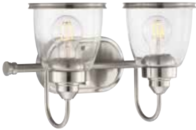
P300179-009 mounted up

P300179-009 Brushed Nickel P300179-020 Antique Bronze 15-1/2" W., 9-1/2" ht. Extends 7-3/4". H/CTR 5". Two medium base lamps, each 60w max.