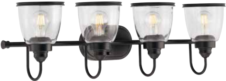
P300181-020 mounted up