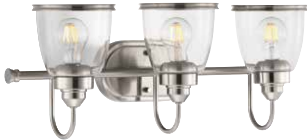
P300180-009 mounted up