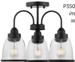
P350109-020 installed as semi-flush