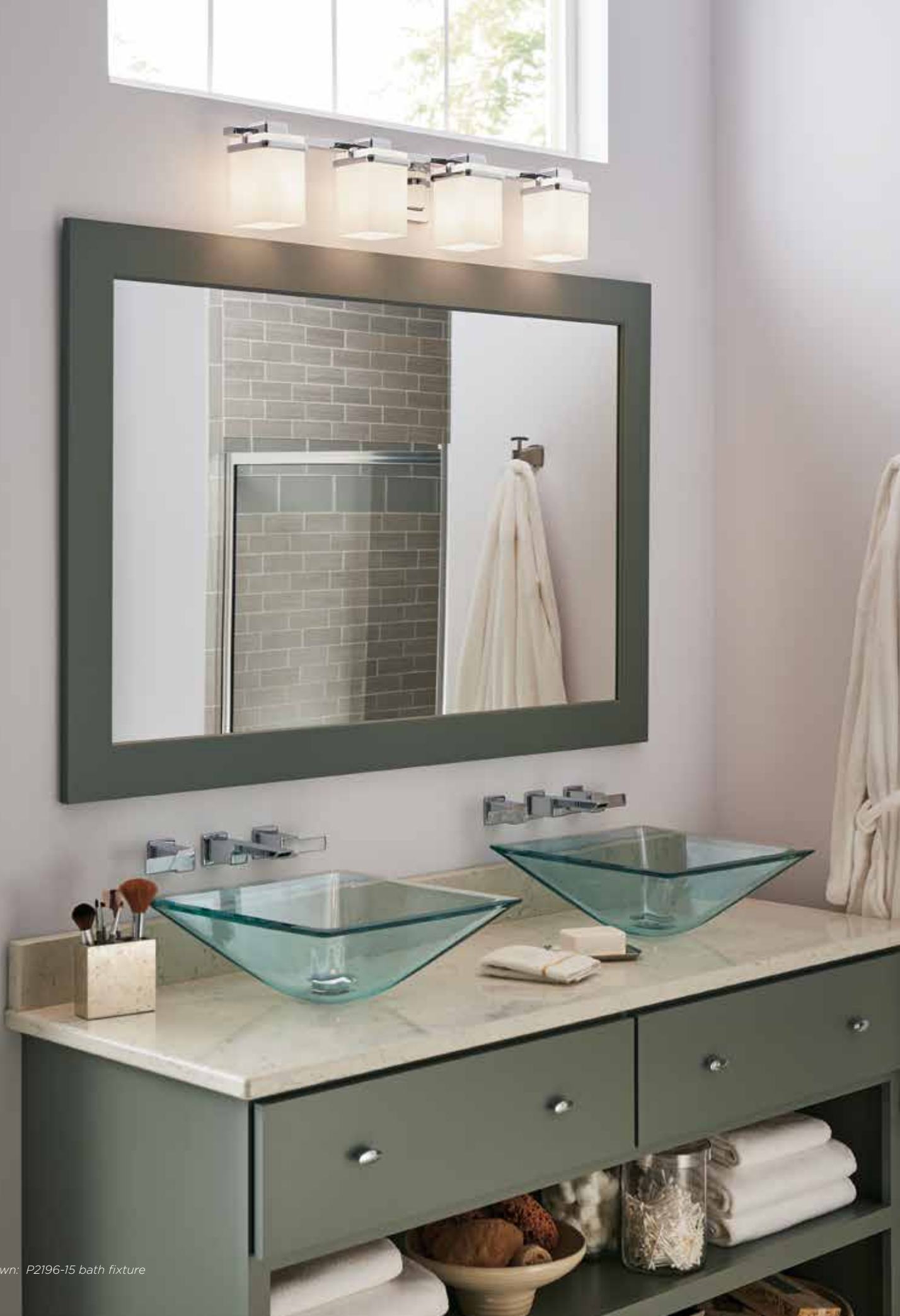
Shown: P2196-15 bath fixture