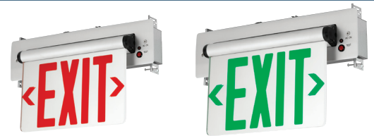
Recessed Mount Wall or Ceiling