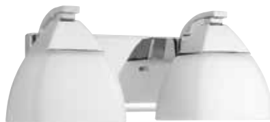
P2701-15 mounted down