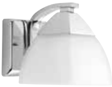
P2700-15 mounted down