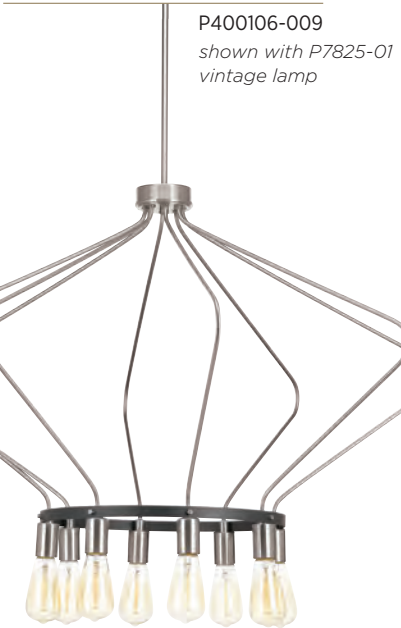
P400106-009 shown with P7825-01 vintage lamp