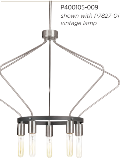
P400105-009 shown with P7827-01 vintage lamp