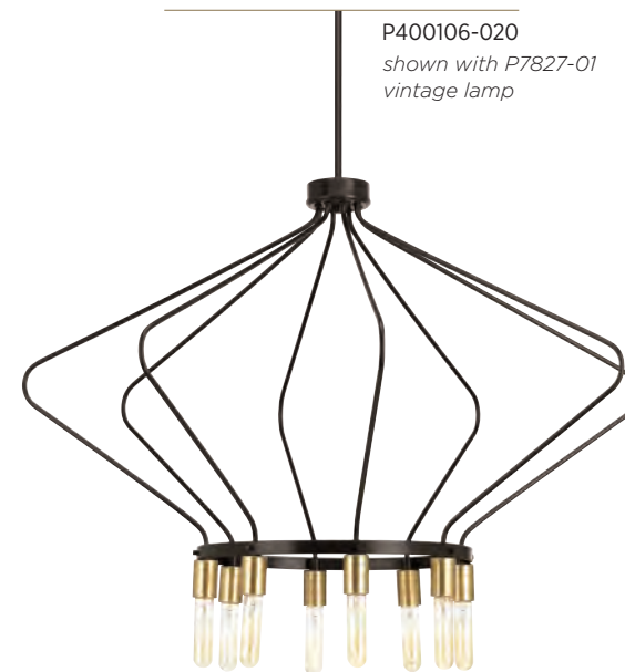
P400106-020 shown with P7827-01 vintage lamp