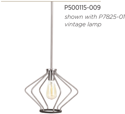
P500115-009 shown with P7825-01 vintage lamp