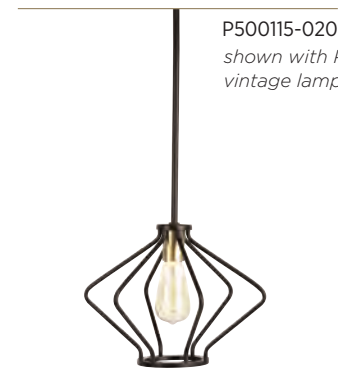
P500115-020 shown with P7825-01 vintage lamp