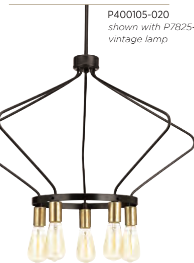
P400105-020 shown with P7825-01 vintage lamp