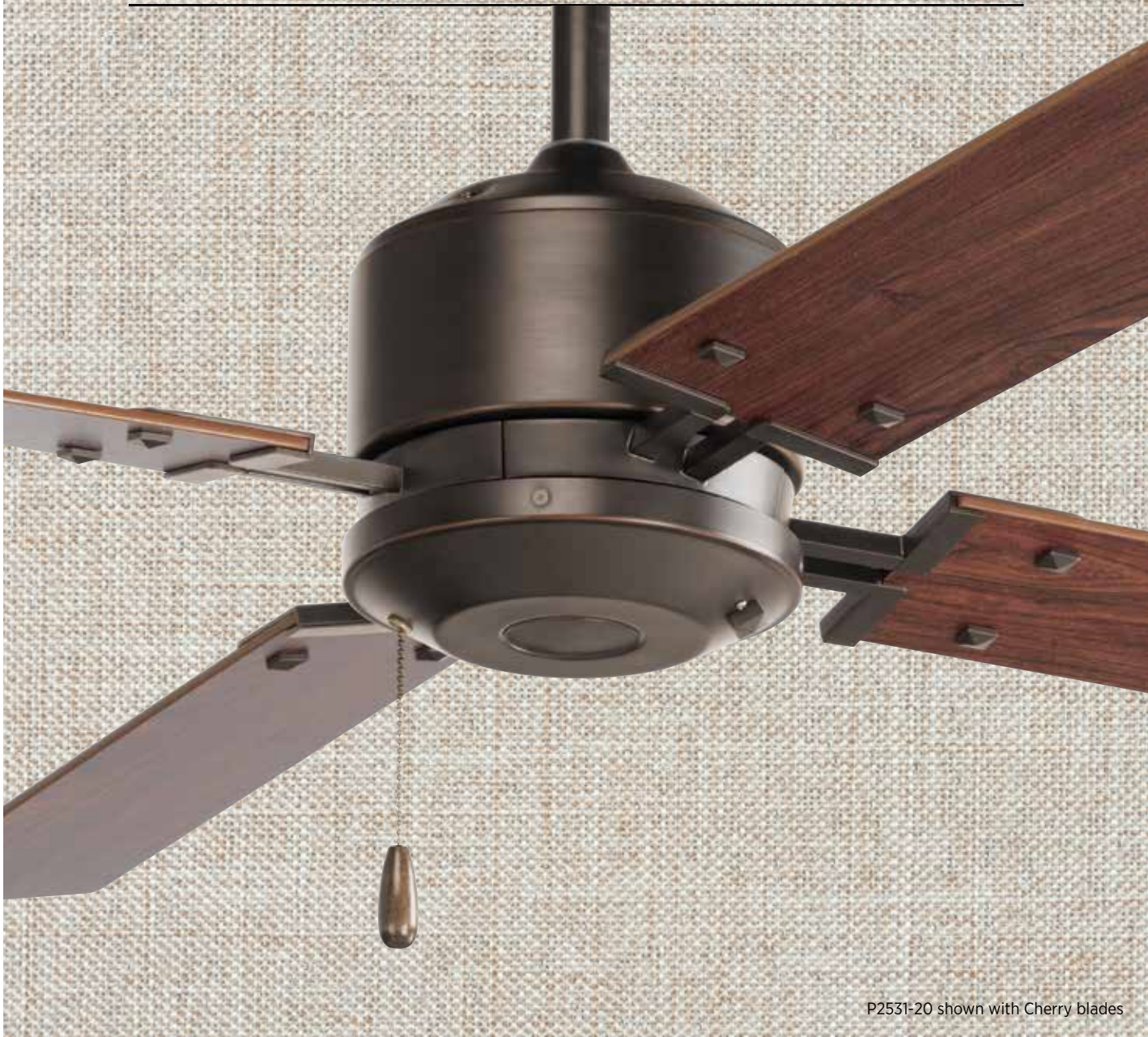
P2531-20 shown with Cherry blades

52" 4-blade ceiling fan with reversible Natural Cherry/Cherry blades and a Brushed Nickel finish or reversible Cherry/Classic Walnut blades and an Antique Bronze finish. The North Park ceiling fan offers great performance and value. This contemporary styled fan features a powerful, 3-speed motor that can be reversed to provide year-round comfort. The North Park fan will also accept a universal light kit.