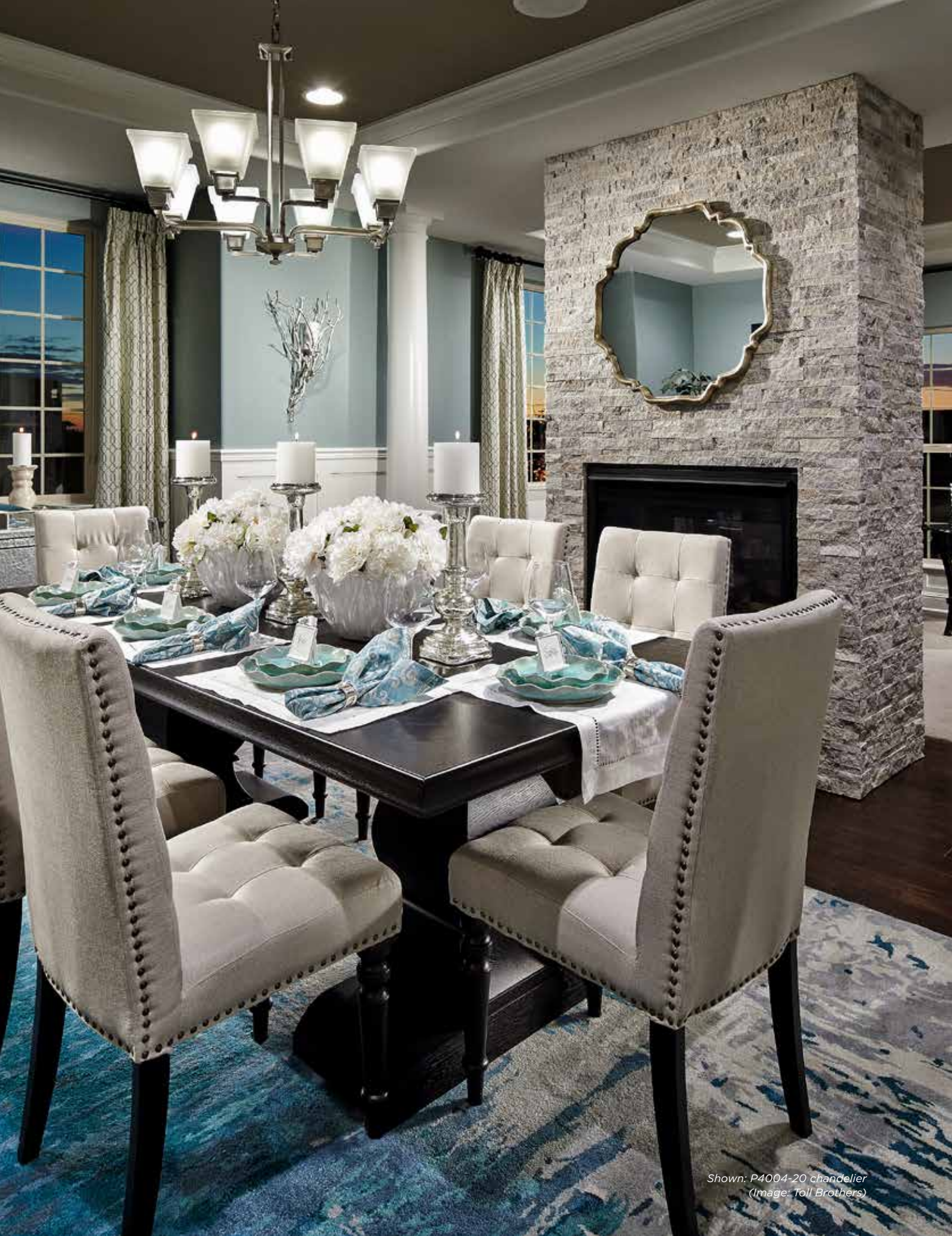
Shown: P4004-20 chandelier