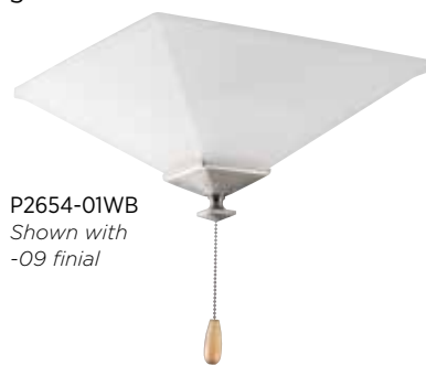
P2654-01WB Shown with -09 finial