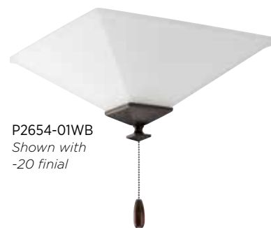
P2654-01WB Shown with -20 finial