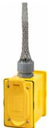
Deluxe Cord Grips (purchased separately)