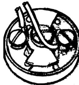
RECOMMENDED TERMINAL SCREW WIRE WRAP (WIRE ENTERS FROM INSIDE)

CAUTION: THESE DEVICES ARE NOT FOR GROUNDING USE. CONNECT ONLY TO NON-GROUNDING CIRCUITS.