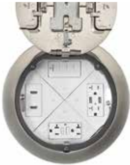
RAFB4NKL with Devices

AFB series boxes are available from our factory as pre-wired assemblies with CONNEXION modular plug-n-play system