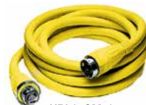
HBL61CM52 HBL61CM52W HBL61CM42 HBL61CM42W

See page AA-13 for features and benefits.