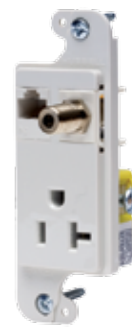
JLOAD® RJ620 Series