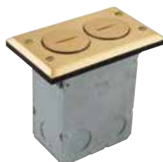
Floor Boxes Kit RF650 Series