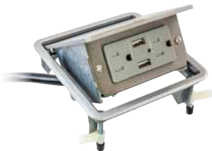
Duplex Receptacle and USB Pop-Up Box Series