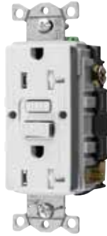
Tamper-Resistant GFTRST Series