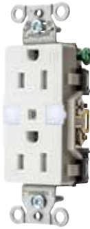
Lighted Decorator DRNL Series