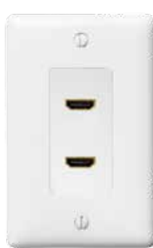
Multimedia Face Plate NSP26 Series