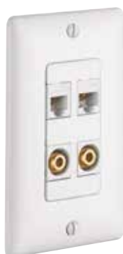
Jacks and Coax NSP106 Series