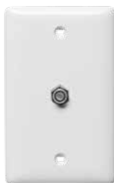
Molded-In NS700 Series