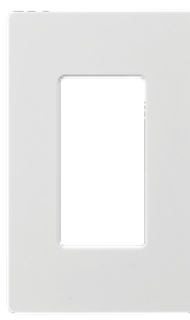
Screwless RCW Series