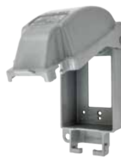
EXTRA DUTY® Rated Metal While-in-Use WP Series