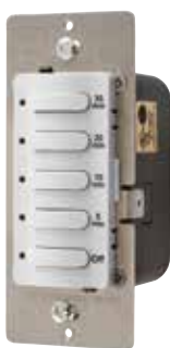
Count Down Timer DT5030W