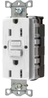
Ground Fault GFRST15SNAP Series