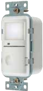
with Night Light WS1000N Series