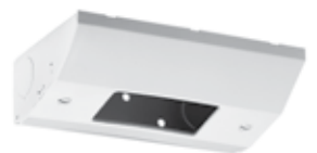
Slim Box RU100 Series