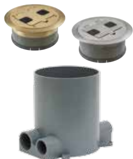
PVC Floor Box RF400 Series