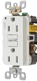
Arc Fault Current Interrupter AF Series