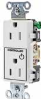
Style Line® Decorator DR15C1 Series