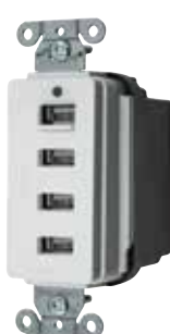
USB Outlets USB Series