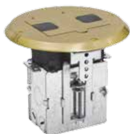
Floor Boxes Kit RF515 Series