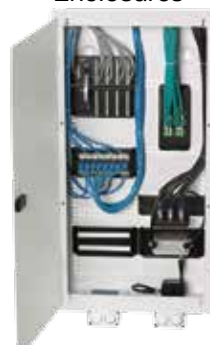
Small/Medium/Large Enclosures NSOBX28