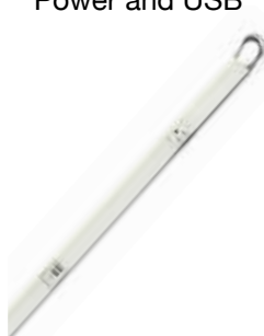
HBL20GB312UIV and HBL20GB612UIV