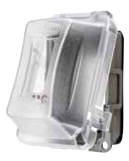
EXTRA DUTY® Rated Plastic While-in-Use RW58000 Series