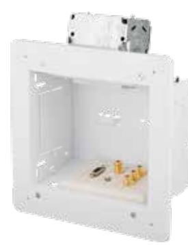
Flat Panel TV Box NSAV62M