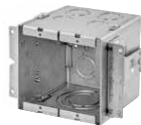
High Capacity Wall Box HBL98 Series