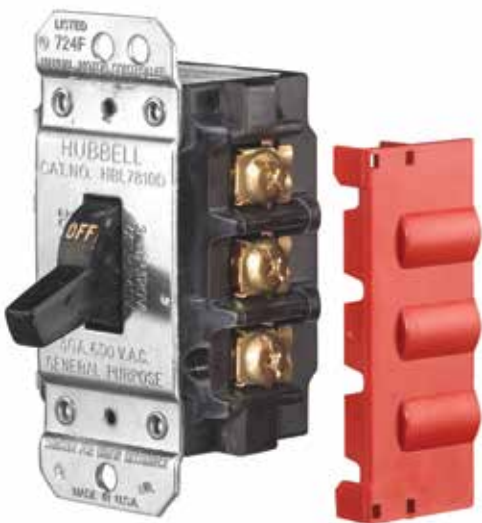
30A, 40A and 50A