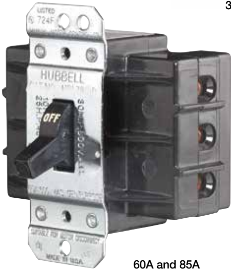
60A and 85A