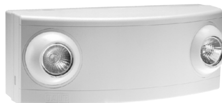
30 Watt Capacity with deep housing