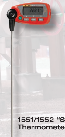
1551/1552 "Stik" Thermometers