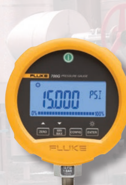
700G Series Precision Pressure Test Gauges