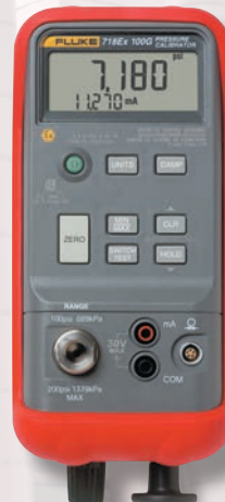
Fluke 718Ex Pressure Calibrator