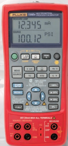
Fluke 725Ex Multifunction Process Calibrator

Fluke offers a wide range of reliable, accurate and intrinsically safe tools. Including the NEW 28II Ex True-rms Multimeter and the NEW Fluke 568 Ex Infrared Thermometer , which compliments the line of Fluke intrinsically safe field calibrators.