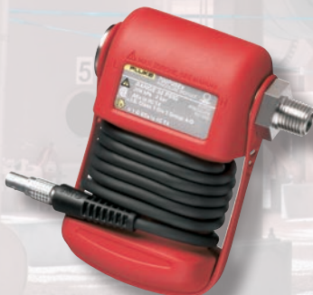
Fluke 700PEX Pressure Modules