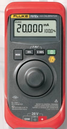
Fluke 707Ex Loop Calibrator