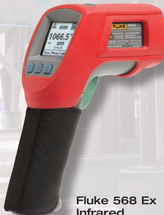
Fluke 568 Ex Infrared Thermometer