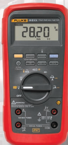
Fluke 28II Ex True-rms Industrial Multimeter