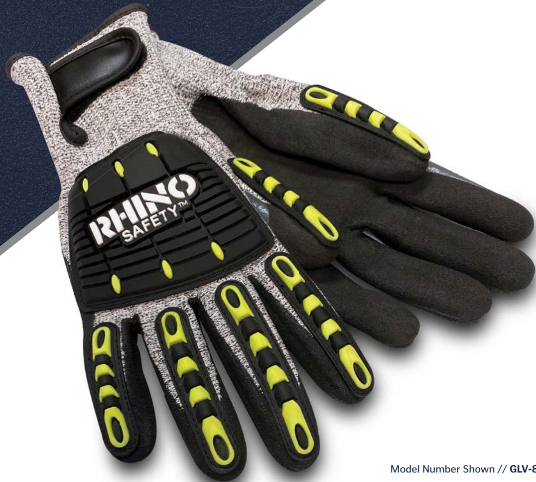
Model Number Shown // GLV-800XL