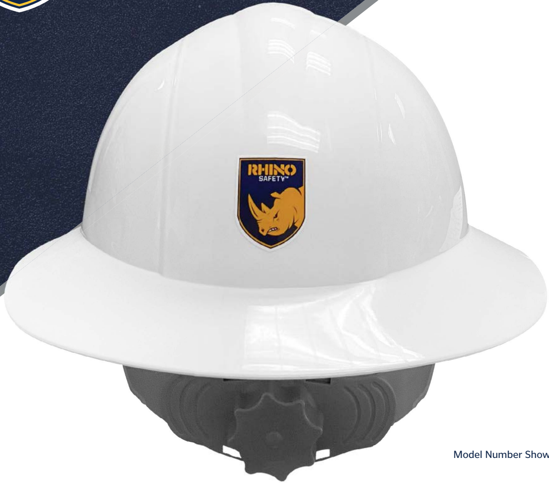
Model Number Shown// SH-200Y