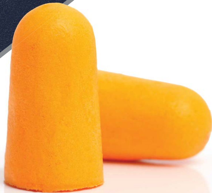
Model Number Shown // FEP-200