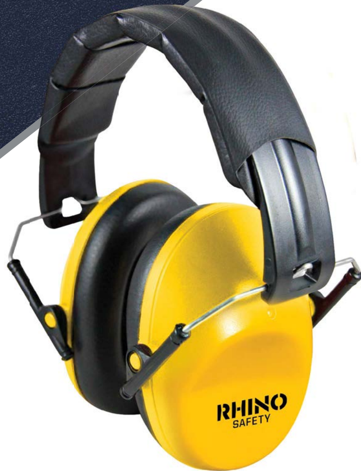
Model Number Shown// EM-138