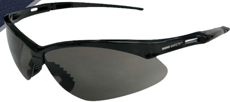
Model Number Shown // SG-300G