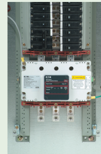
In this installation, the SPD Series is mounted directly to the panelboard's bus bars. This type of installation will provide the best possible surge protection by minimizing the connected lead length.