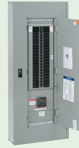
SPD Series unit integrated within an Eaton panelboard.