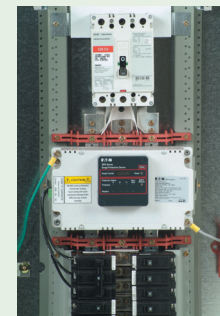
The SPD Series is also available as an integrated unit interfaced via a circuit breaker resident in the electrical assembly. This installation keeps connected lead lengths short while providing a means of disconnecting power to the unit quickly and easily.