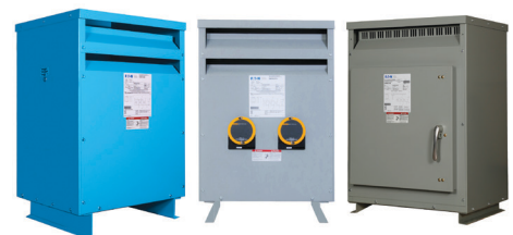
Flex Center transformer solutions

Eaton 1000 Eaton Boulevard Cleveland, OH 44122 United States Eaton.com