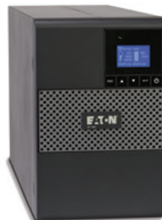
Tower: 750–3000 VA