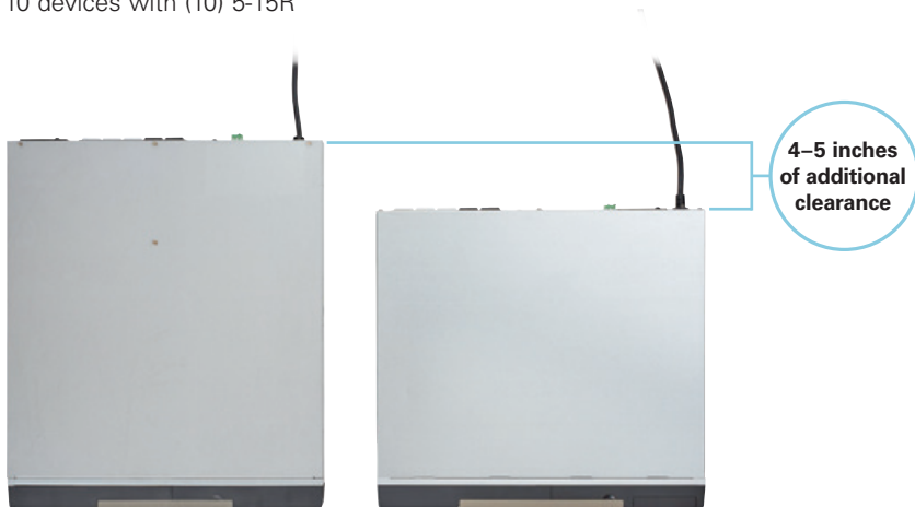
The Eaton 5P rackmount compact UPS features a shorter depth than the 5P 1U