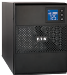
500–1500 VA tower with LCD