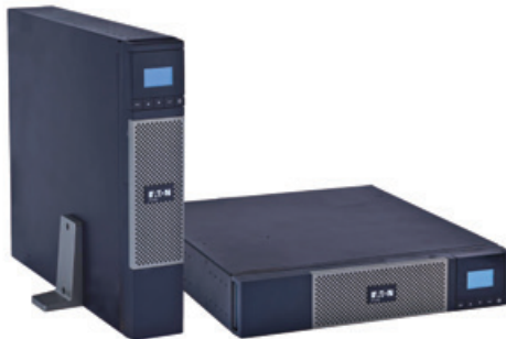
2U rackmount/tower: 1440–3000 VA