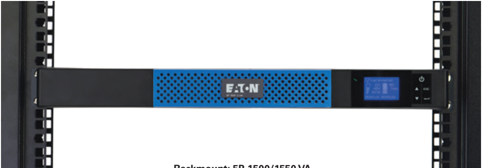
Rackmount: 5P 1500/1550 VA