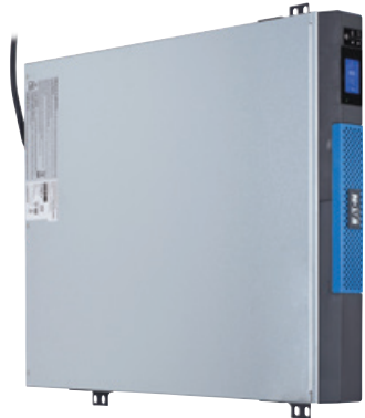
Wallmount: 5P 1500/1550 VA