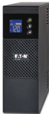
700–1500 VA models with LCD