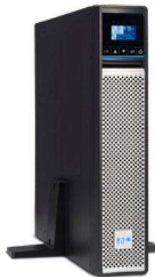
Tower: 1000–3000 VA