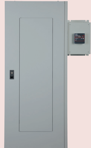
Eaton SPD Series sidemount unit mounted externally to an Eaton panelboard.