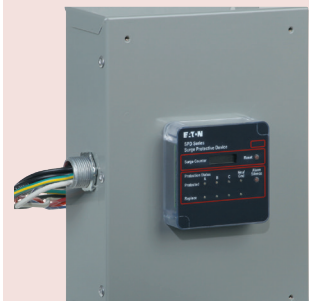
All SPD Series sidemount units come prewired and include a factory-installed conduit interface, making installation very easy.