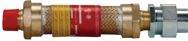
ECLK (ECGJH provided with UNF female union – male connection at one end, female connection at one end)

2 1/2" to 4" – stainless steel construction only