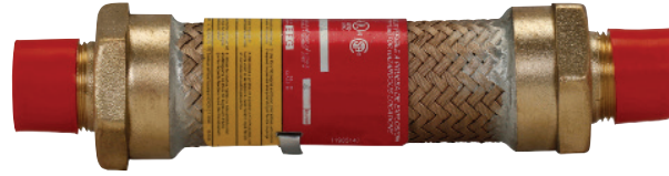
ECGJH (male connections at both ends) (shown furnished with protective caps)