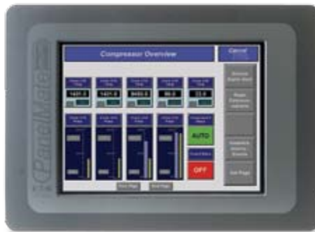
ePro PS: 8.4" to 15" and Blind Node Windows XP Embedded

Three hardware families—one software package