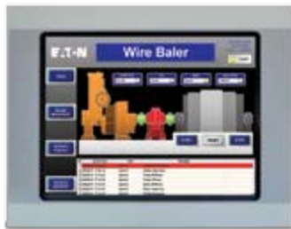
XP: 8.4" to 15" and Blind Node Windows XP Embedded