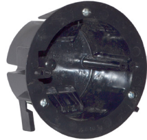
TP16200, (TP16201 – 2 1/8" deep) old work

Weight limit: 50 lbs. for fixture except where indicated.