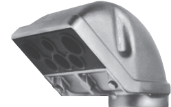
2 1/2" to 4" size