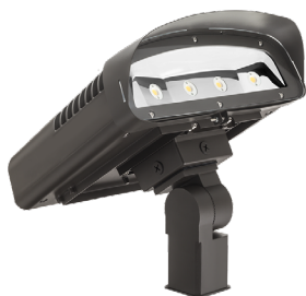
OLWX2TS Slipfitter for OLWX2

Standard size tenon is 2 1/8". The slip fitter has a range of 2" to 2 3/8".