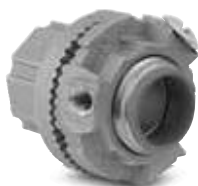
H050GRSST Stainless Steel Grounded Hub