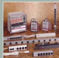
Power & Data Quality