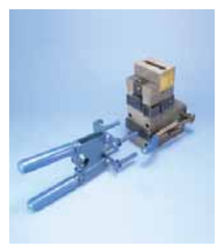
"E" and "J" Price Key Mold L160 or L159 Handle Clamp Required