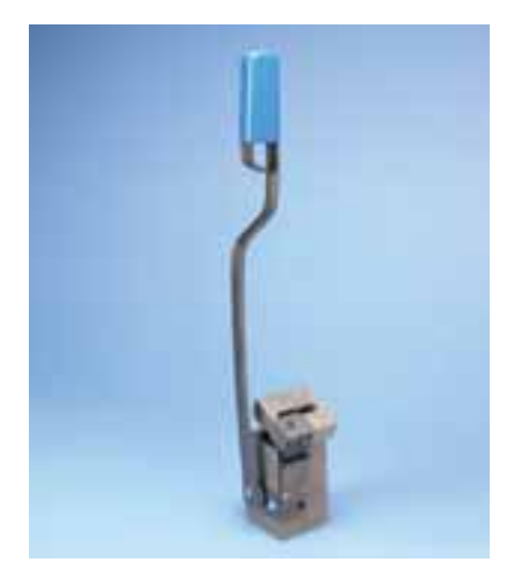
"A" Price Key Mold Includes Hold Down Frame

Pictured below are the molds and handle clamps / and or frames and handles for the various price key molds: