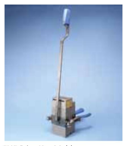
"H" Price Key Mold Includes Hold Down Frame with Handles