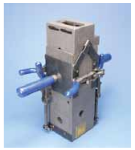
"M" and "V" Price Key Mold Includes Frame with Handles