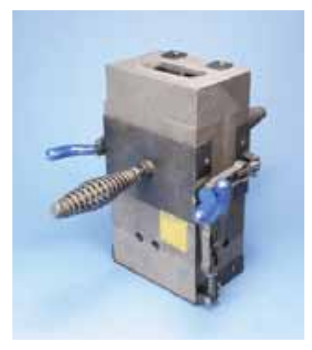
"G", "K", and "L" Price Key Mold Includes Frame with Handles