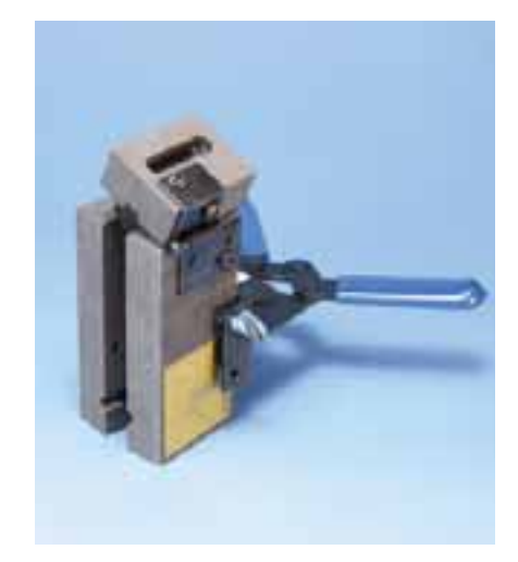
"T", "P" and "N" Price Key Mold Includes Mini-EZ Handle Clamp To order mold only, add an "M" suffix to the part number (for example, SST1T M )