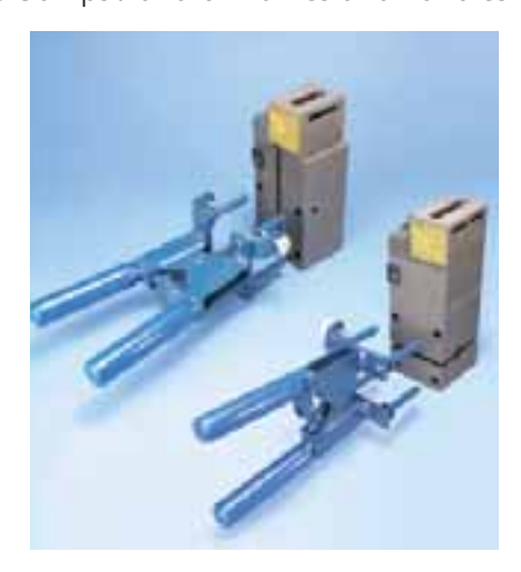
"C", "D", "F", "R", "Q" and "Z" Price Key Mold L160 or L159 Handle Clamp Required