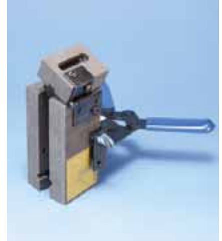
"T", "P" and "N" Price Key Mold Includes Mini-EZ Handle Clamp To order mold only, add an "M" suffix to the part number (for example, SST1TM)