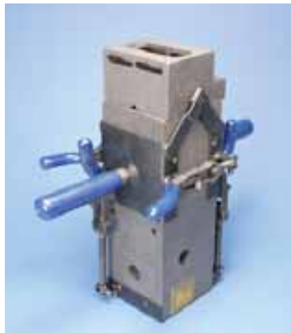
"M" and "V" Price Key Mold Includes Frame with Handles