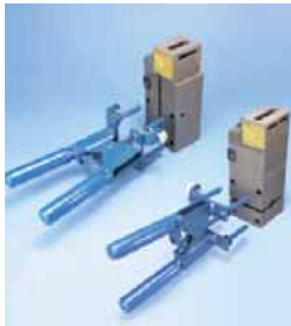
"C", "D", "F", "R", "Q" and "Z" Price Key Mold L160 or L159 Handle Clamp Required