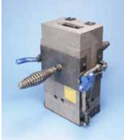
"G", "K", and "L" Price Key Mold Includes Frame with Handles