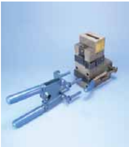
"E" and "J" Price Key Mold L160 or L159 Handle Clamp Required