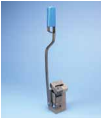
"A" Price Key Mold Includes Hold Down Frame

Pictured below are the molds and handle clamps / and or frames and handles for the various price key molds: