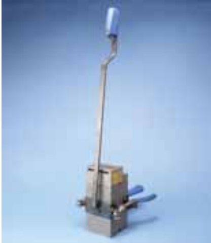
"H" Price Key Mold Includes Hold Down Frame with Handles