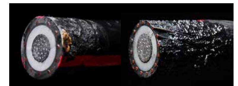
Cable Protected with Scotch® Fire Retardant Electric Arc Proofing Tape 77 After Test