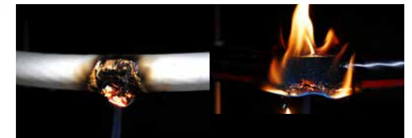
Cable Protected with Scotch® Fire Retardant Electric Arc Proofing Tape 77 During Test