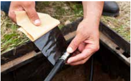
Scotch® Vinyl Mastic Tape 2200 and 2210

3M and Scotch brand Mastic Tapes are an excellent choice when you need to create watertight connections. Mastic tapes also work wonders to pad sharp edges and to smooth out irregular shapes and transitions, plus they're soft enough to mold by hand. The extra padding offered by mastic tapes provides protection against vibrations that may wear through other materials over time.