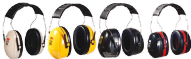
3M Peltor Optime Earmuffs: A market standard

3M Peltor Optime Earmuffs offer versatile protection that meets the needs of a majority of workplace applications.