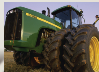
Great paint lines