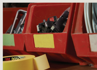
Perfect for labeling