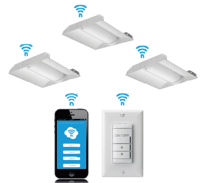
nLight® AIR Platform