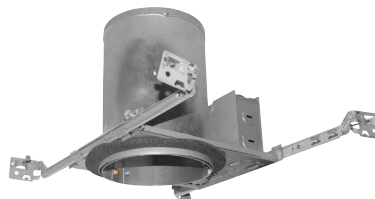
11 1/2" L x 6 3/4" W x 7 1/2" H Ceiling cutout: 5 5/8" diameter