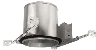
13¼" L x 7½" W x 7¼" H Ceiling cutout: 6⅞" diameter