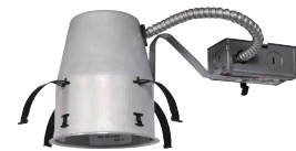
12" L x 4¼" W x 5½" H Ceiling cutout: 4¾" diameter