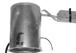
12 1/2" L x 5 3/4" W x 7 1/2" H Ceiling cutout: 5 1/2" Diameter