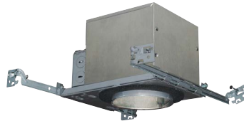
12¼" L x 6¾" W x 6" H Ceiling cutout: 4½" diameter