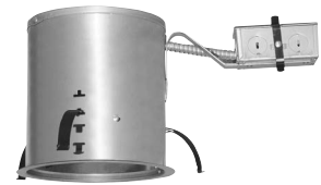
13¼" L x 7⅞" W x 7¼" H Ceiling cutout: 6¾" diameter