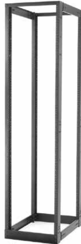
4-Post Rack Recommended for mounting servers