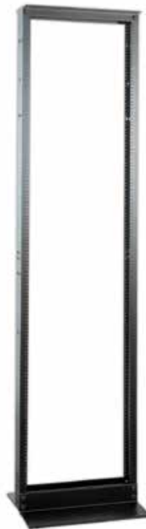
3" Deep Rack Recommended for Cat 5e/6 cables