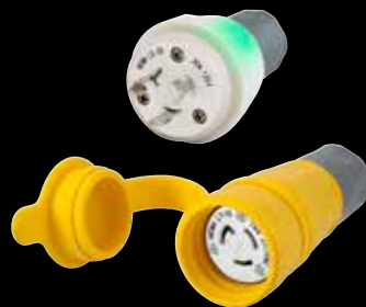
TWIST-LOCK® WIRING DEVICES