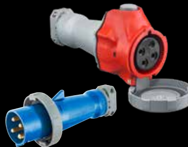
PIN & SLEEVE DEVICES