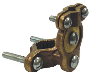
For Bare Armored Ground Wires RACO 2507, and 2508