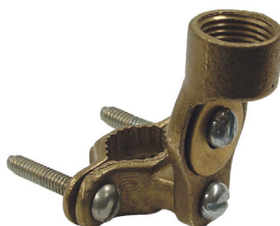
For 1/2" and 3/4" Rigid Conduit RACO 2512, 2522, and 2513