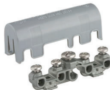
For Solid or Stranded Conductors RACO RACIBB