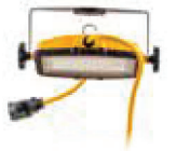
LED Stringer Lights

**Max watts per fixture. HBL142SJ100PS light strings are rated for 1875 Watts total. The total wattage must be considered when daisy chaining lights strings to each other.