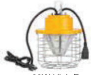
60W High Bay LED Light