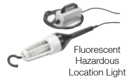
Fluorescent Hazardous Location Light