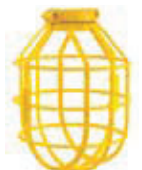
Plastic Guard for Temporary Light Strings