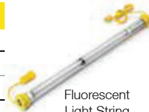
Fluorescent Light String Straps not Shown