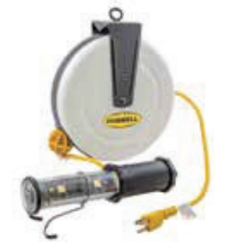
Reel with LED Hand Lamp