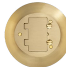
Style Line® Decorator Opening