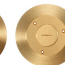
2 1/8" Single Receptacle