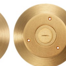
2 1/8" x 1" Combination