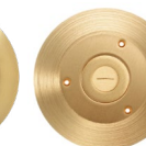
2 1/8" x 3/4" Combination